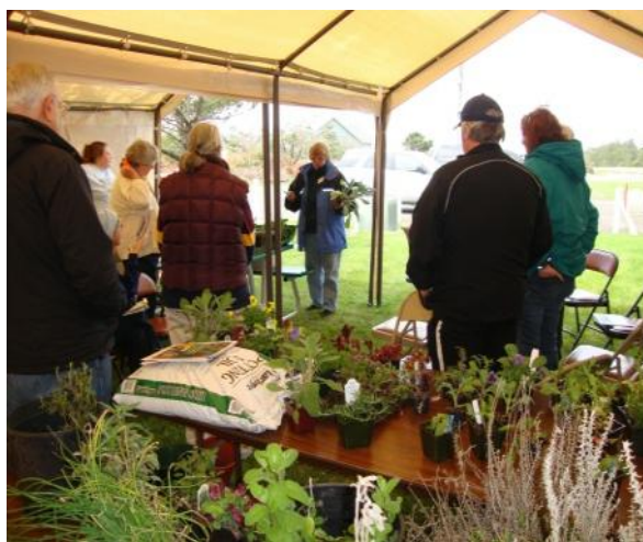
Above attendees, left the Planter of edibles at the Surfside Office.