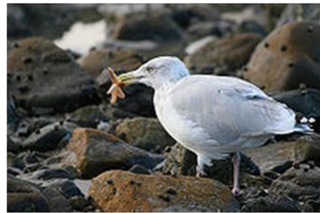
A gull eating a sea star.