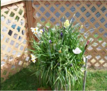
April 23, 2010