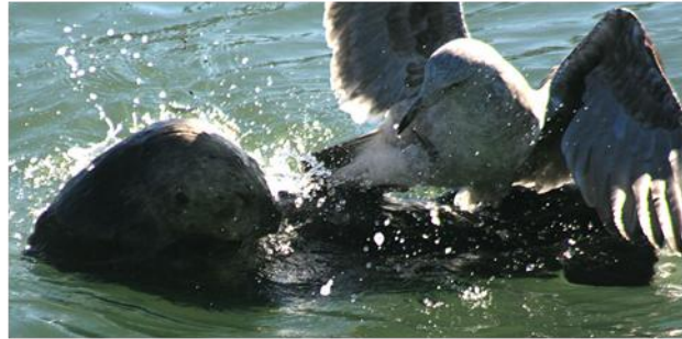
A gull landing on a sea otter, probably trying to steal its prey