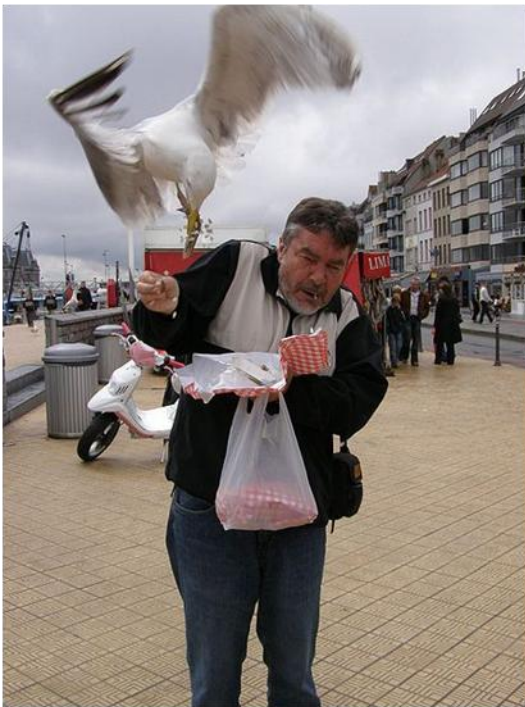
Gulls also steal food from people