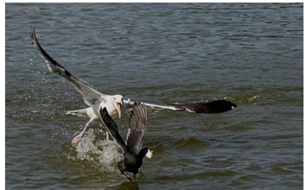
A gull attacking a coot. Note that this gull is probably going after the bread or other food item in the bill of this American Coot, though Great Black-backed Gulls are known to kill and eat coots.