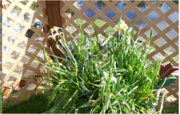
Faded Glory the last of the 100 Days of Color