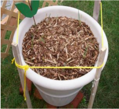
January 7, 2010 peeking thru.