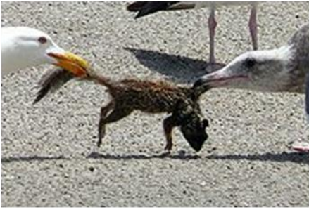
Two Western Gulls (adult and juvenile) fight over a freshly-killed ground squirrel