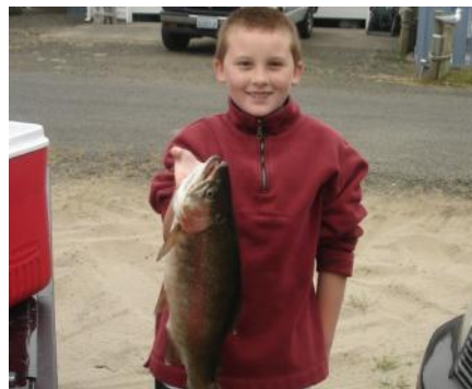
Last years delighted winner!

If you have some time, enjoy children and would be willing to organize this event please contact the office at 360-665-4171.