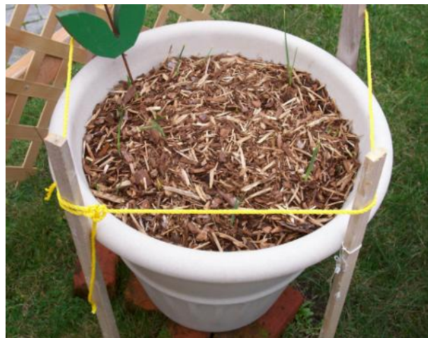
Spring cannot be far behind! The "100 Days of Color" planter is starting to peek through!

One of the committee's projects for 2009 was the "100 Days of Color" which is now starting to show growth. Stop by and check out the planter at the back of the Surfside Business Office. The Community Relations committee sponsored a workshop in the fall to teach anyone interested in how plant for a show stopping display of color! It is going to be fun to watch the progress of the planter!