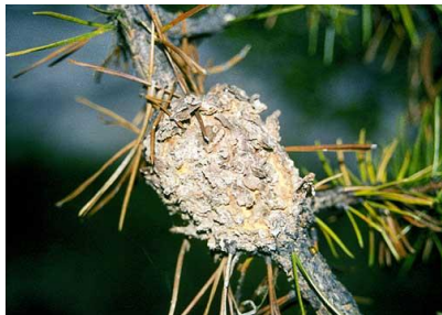
This is a typical gall produced by this disease.