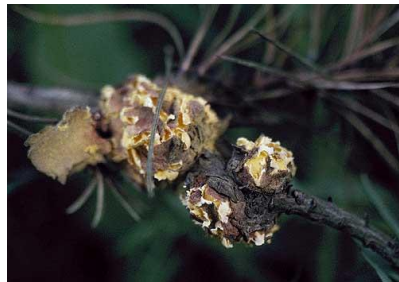
Orange pustules are the active aecia (spore producing body) of this fungus.