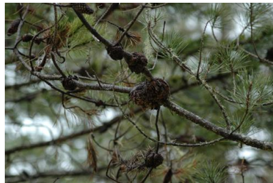
Numerous galls can occur in susceptible trees.