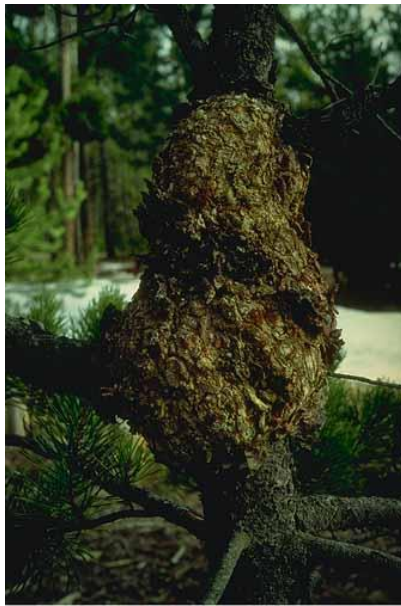
Note the swollen lodgepole pine trunk.

Symptoms: Rough, globular galls on trunk or branches. Galls are proportionate in size to the branches bearing them. When the fungus is fruiting (aecia), galls are orange or yellow. Galls may kill small trees but increase in size for many years on larger trees. Trees may break easily at the gall.