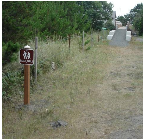
318 th Foot Bridge

All of the east trail heads have been marked.