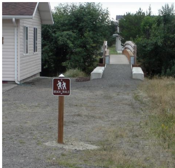
329 th Foot Bridge