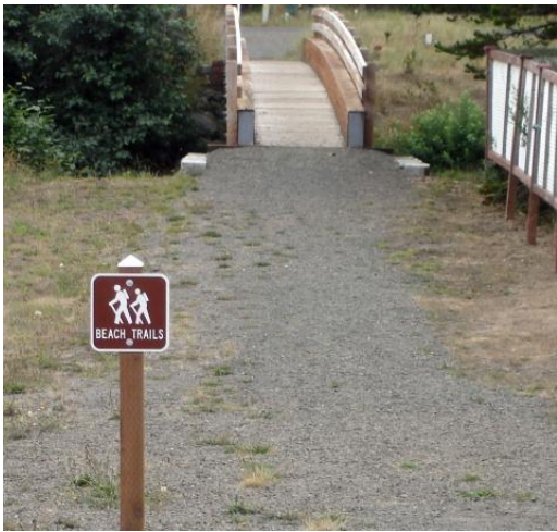
311 th Foot Bridge

New signs designating the walking easements to the beach have been installed at the trail heads.