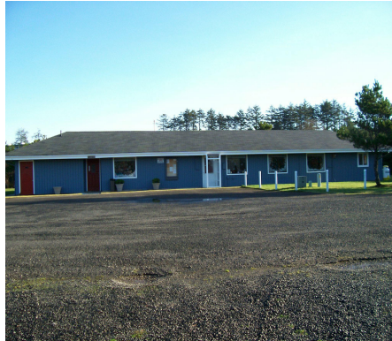
SURFSIDE OFFICE AND BOARD/COMMUNITY ROOM

Come and meet your Board Members and staff. This is your opportunity to participate, express your views and help Surfside be the community that you want it to be.