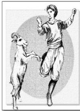
What Does Dancing Goats Have To Do With Coffee?

This new column will appear in our Weekender once a month. We are providing this column to keep our members up to date on issues related to will help answer question you may you enjoy this column. It will be wri-tional and fun to read. This month we The Danube is blue, the Pacific Ocean the water at our tap is crystal clear. like the Mississippi and the Pacific our water has a yellowish tinge to it. carbons found in our well water. Our to the marshy areas located in our wa-lease tannic acids (organic carbons) and percolates into the ground. Percolate is this process most mornings in their thank God for Folgers in my cup. Now, of my shower? Our filtration system well water very nicely. It does not remove the tannins. The yellow color distracts from the appeal of the water but it will not harm you. The water delivered to the homes and businesses in Surfside is safe to drink. The Board of Trustees is looking at different measures to bring the water to a crystal clear appearance. They would love to hear from you on the issue. Until next month, keep the coffee hot and strong.