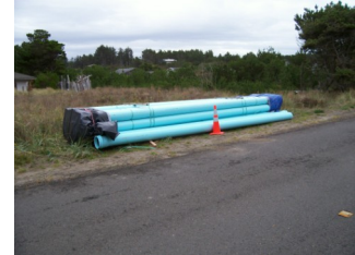
Pipe for the project.