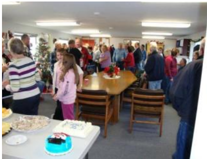
Neighbors and friends gather to say farewell!