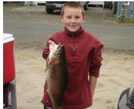
Last years delighted winner!

If you have some time, enjoy children and would be willing to organize this event please contact the office at 360-665-4171.