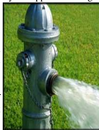
Well Maintained Water Mains!

The languid, hysterics and delirium of summer is over and so... we are starting our winter water main flushing program. Flushing water mains may seem to be a waste of water to some. If performed improperly it is. The trick to a conservative