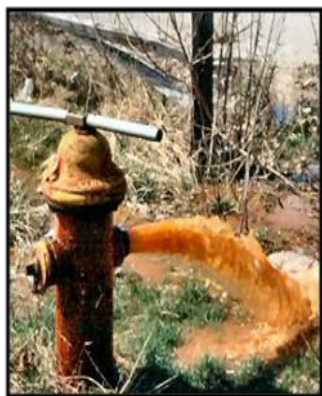
Poorly Maintained Water Mains!

The Dog Days originally were the days when Sirius rose just before or at the same time as sunrise (heliacal rising), which is no longer true, owing to precession of the equinoxes. The Romans sacrificed a brown dog (unforgivable) at the beginning of the Dog Days to appease the rage of Sirius, believing that the star was the cause of the hot, sultry weather. Dog Days were popularly believed to be an evil time "when the seas boiled, wine turned sour, Quinto raged in anger, dogs grew mad, and all creatures became languid, causing to man burning fevers, hysterics, and phrensies". Now I am really happy the Dog Days of Summer