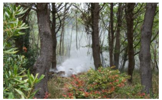
April 30, 2010 this fire at 300<sup>th</sup> and H Place was started from an unattended vegetation burn

Outdoor fires can be useful for burning natural vegetation or creating a social gathering point for friends and family. Unfortunately, many people do not properly extinguish their fire when they are done using it. Fires that are not completely extinguished can continue to smolder for several days. Fires can re-start with a change in winds, fires can grow through sub-surface root systems, or simply catch other flammable materials that are too close. Unattended fires present a real fire hazard, and should not be treated lightly.