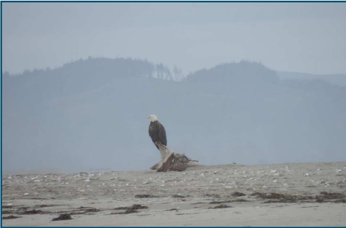
Taken 7/22/2021