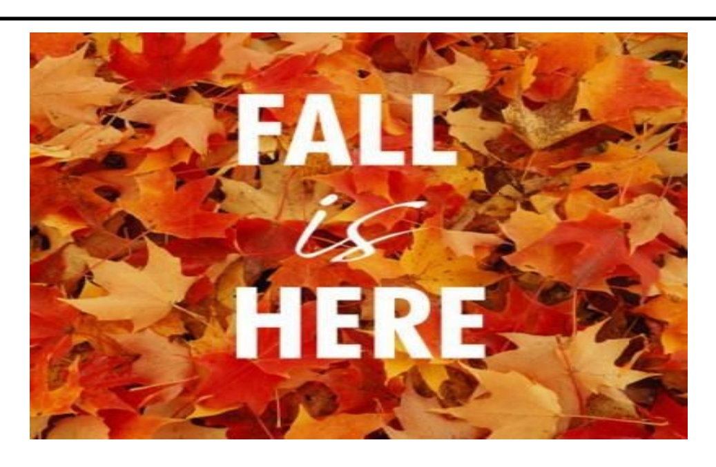
Now is the time to winterize.