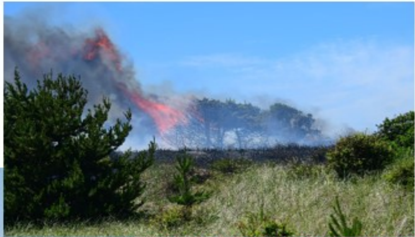
Surfside Dune Grass and Shore Pine Fires 2016

Defensible space is the area between a house and oncoming wildfire where vegetation has been modified to reduce the wildfire threat and provide opportunity for effective firefighting. A defensible space can simply be a properly maintained backyard.