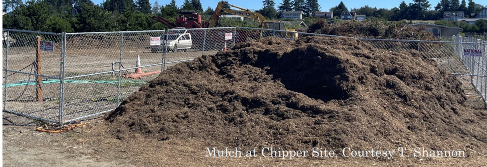
Mulch at Chipper Site

Now that the chipper site has closed for the season, we would like to remind everyone there is free mulch to pick up at the site in front of the fence. For those members who would like to take advantage of the free mulch, but do not