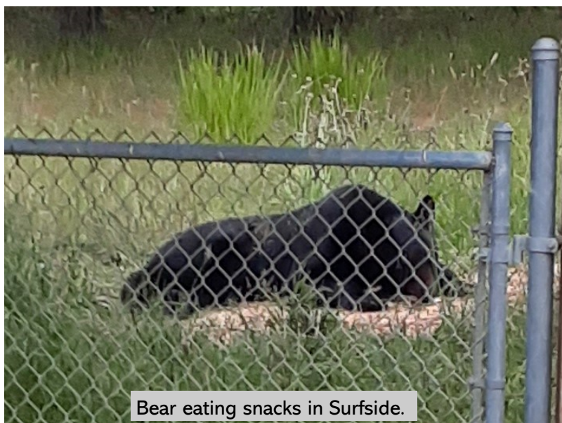
Bear eating snacks in Surfside.

To read more on bears from the Department of Fish and Wildlife, go to Living with Wildlife – Black Bears .