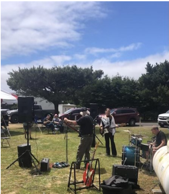
Riptide performing at the Annual Picnic