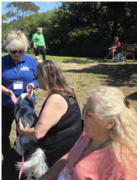
The 3 judges